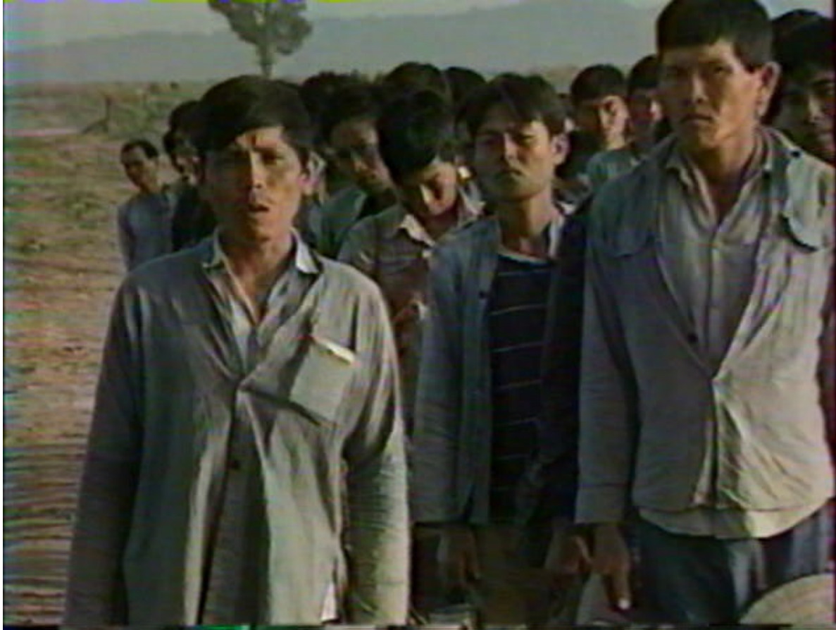
Xuan Loc Camp - A team of prisoners set off for work. On the left is the "team leader", a prisoner who works as an informer for the prison authorities in exchange for certain privileges or improved detention conditions. In his pocket is a note book to write the names of prisoners who commit faults or fail to fulfill the labour quotas. Punishment includes reduction in prison rations - which makes weak prisoners even less able to fulfill the extenuating work quotas, in the 1990s