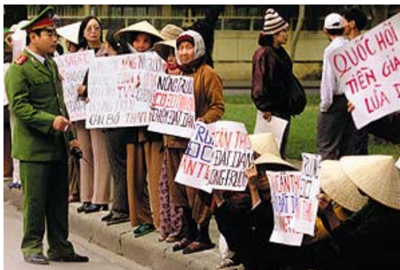
Farmers demonstrating in Hanoi to protest State confiscation of lands (2002)

Freedom of assembly and the right to peaceful demonstrations, guaranteed in the Constitution (Article 69) is also restricted by government directives and decrees. In 2002, following a wave of demonstrations staged by farmers outside government buildings in Hanoi protesting against official corruption and State confiscation of their lands, CPV Secretary-general Nong Duc Manh exclaimed: "It is abnormal for people to demonstrate with banners. In many cases, our democracy is excessive" 33 . On 18 March 2005, Vietnam adopted Decree 38/2005/ND-CP banning such peaceful protests. The Decree prohibits demonstrations outside State agencies and public buildings, and bans all protests deemed to "interfere with the activities" of Communist Party leaders and State organs.