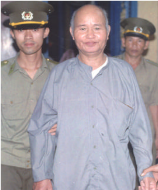
Thich Quang Do at his trial in Saigon on 15.8.1995. Arrested in November 1994 for organizing a rescue mission for flood victims, Thich Quang Do was sentenced to 5 years in prison and 3 years house arrest at a one-day, closed trial, on charges of "sabotaging the government's policy of religious solidarity" and "taking advantage of the rights of liberty and democracy to harm the interests of the State"