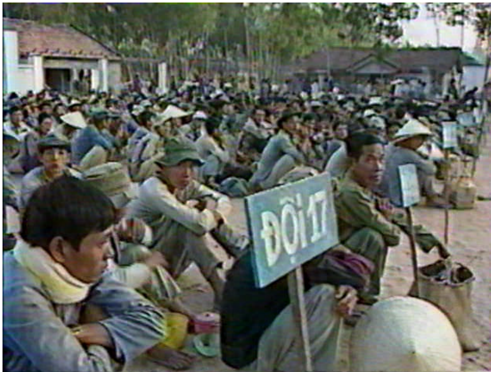
Xuan Loc Camp - Prisoners gather in teams for the morning roll-call before going to work , in the 1990s

"Sometimes we were alone in a cell and our hands and legs were shackled. Many prisoners were kept in chains. I had chains on my feet for 6 years".